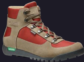
MAN A25500 00 B157 wool-black cherry