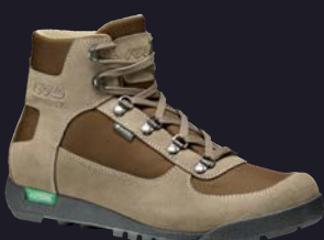
MAN A25500 00 B159 wool-desert beige