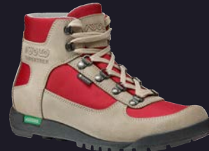
WOMAN A25501 00 B154 earth beige-chilly red