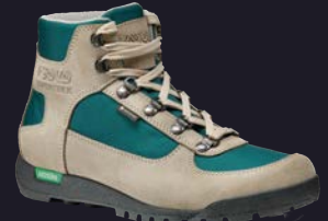
WOMAN A25501 00 B155 earth beige-deep tail