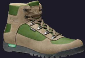
MAN A25500 00 B160 wool-garden green