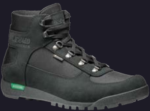
MAN A25500 00 A778 WOMAN A25501 00 A778 black-black

Best use: Vintage hiking boots restyled for modern every day wearing on and off the trails.