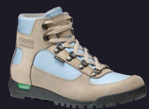
WOMAN A25501 00 B153 earth beige-blue fog