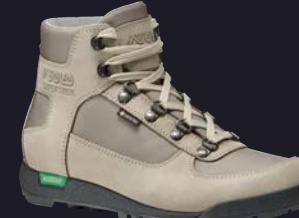
WOMAN A25501 00 B152 earth beige-beige