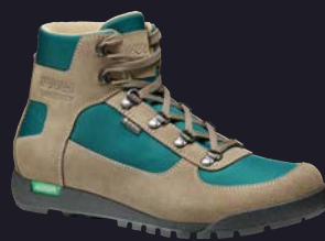
MAN A25500 00 B158 wool-deep tail