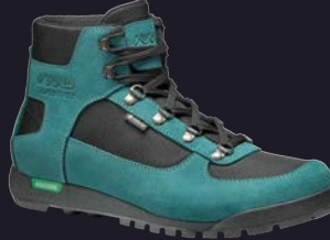
MAN A25500 00 B156 WOMAN A25501 00 B156 petroleum-black